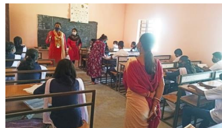
Outreach awareness about 1098 services and PSS base in Govt. High School Aul