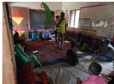
Mock drill session at Kandarapatia village