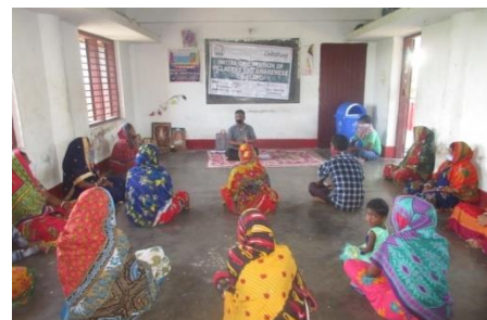
Orientation of villager's awareness on VLCPC 18/9/2020

❖ The villages where the VLCPC committees initiated were went