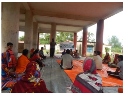
VPC orientation cum meeting at North Jamboo on 22/9/2020

Village Level Child Protection Committees in all the villages where it was operational reorganised and trained on the Child Protection issues. Particularly how to coordinate with the Panchayat level child protection unit and link further with BLCPC and DCPU. Further awareness and existence of CHILDLINE in Kendrapada also discussed. How to contact the toll free number 1098 was also discussed