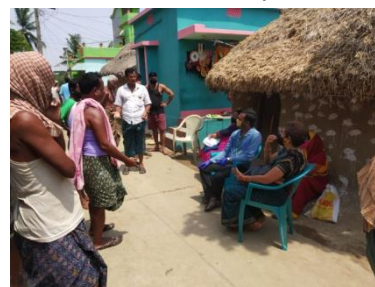
Child marriage case intervention at Sujayanagar, Kendrapada